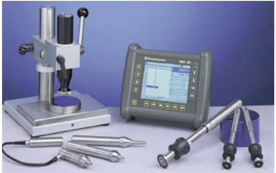
"Hardness testing as a twin pack": The MIC 20 with a selection of rebound impact devices and UCI probes, as well as with the quick support including motorprobe.

The MIC 20 makes for example the calibration easy for you. The setting parameters are then simply filed and recalled by pressing a button or by a "click" in the corresponding application case.